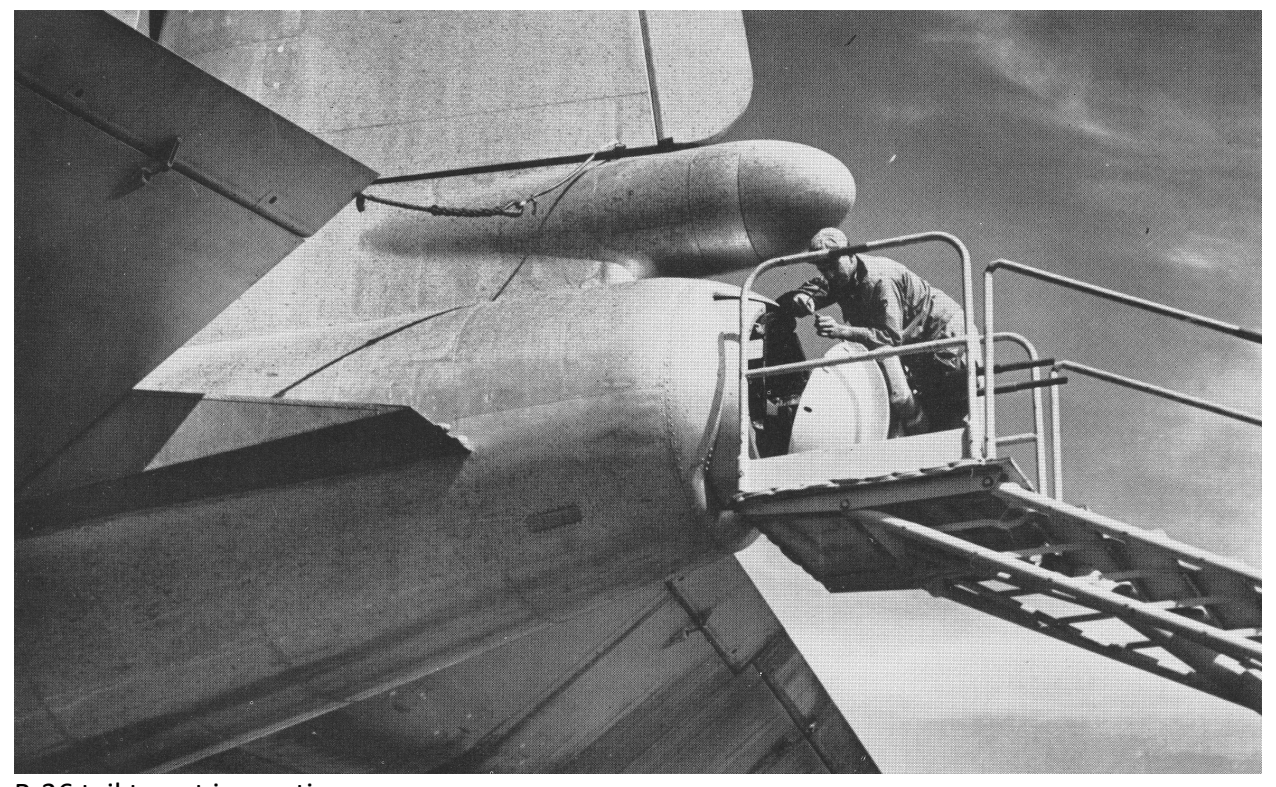
B-36 tail turret inspection